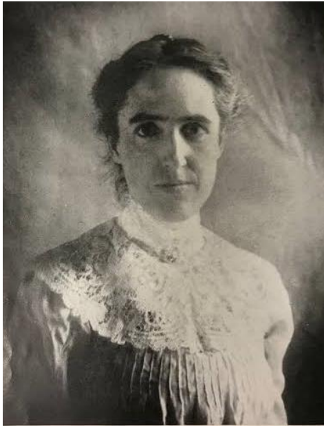
HENRIETTA SWAN LEAVITT At about 30 years of age.

Henrietta Swan Leavitt was an American astronomer. A graduate of Radcliffe College, she worked at the Harvard College Observatory as a "computer", tasked with examining photographic plates in order to measure and catalog the brightness of stars. This work led her to discover the relation between the luminosity and the period of Cepheid variables. Leavitt's discovery provided astronomers with the first "standard candle" with which to measure the distance to faraway galaxies.