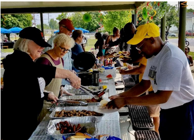
Members of the DEI Committee assisted with the Juneteenth Party in the Park on Saturday June 17th by helping to set up and serve. It was a very well-attended event and a respectful celebration of the new National Holiday.

Our DEI Committee has been busy in June. On June 14th we hosted a speaker from the Disability Network of Southwest Michigan who presented "Disability and Allyship". It was a very good presentation and we all learned how we could better support people with disabilities.